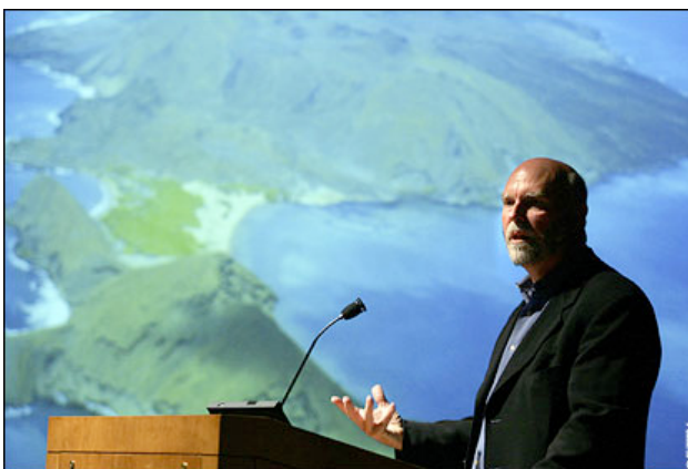
Craig Venter likened the process to 'changing a Macintosh computer into a PC by inserting a new piece of software'

The team that carried out the first "species transplant" says it plans within months to do the same thing with a synthetic genome made from scratch in the laboratory.